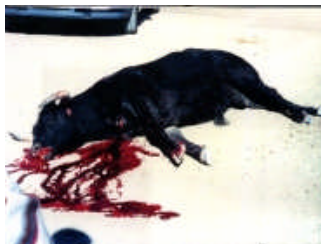
Toro de la Vega (Tordesillas-Spain).

This is a semi-religious ritual which happens during a feast to the Virgin Mary.