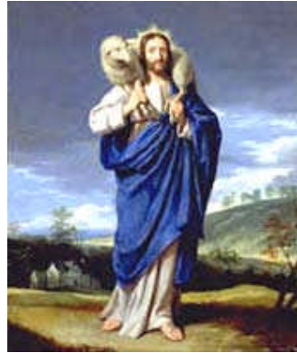
Le Bon Pasteur Philippe de Champaigne Musée des Ursulines Mâcon - France

"The animals are here to be at the service of man, who can use and abuse them at will".